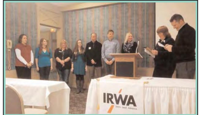
New Members being installed at the Spring Quarterly Meeting in March 2014. WELCOME TO CHAPTER 17!!

Application forms for student membership can be found at www.irwaonline.org/eweb/upload/Forms/Moo7.pdf