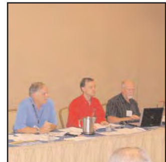
Region 5 Leadership