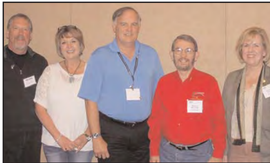
Five Balfour Recipients were present at the meeting. L-R:

Plans for the 2013 Region 5 Spring Forum are currently in the works. Badger Chapter 17 will be hosting the event in Milwaukee, Wisconsin. More information will be provided as it becomes available.