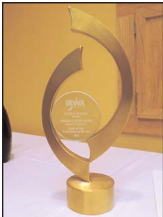
Balfour Award on Display at the General Meeting in Wisconsin Dells, September 13, 2012