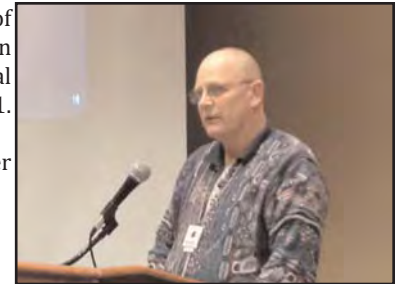
Certification/Designation Update Presentation at the 4th Quarter IRWA General Meeting 12/8/2011.