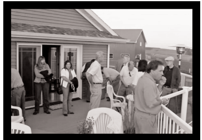
Members enjoying the view and camaraderie at the social event.