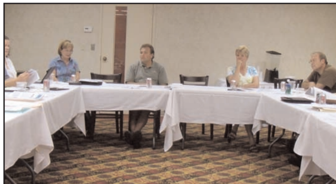
Officers and Committee Chairs deliberate at the 3rd Quarter Executive Board Meeting.