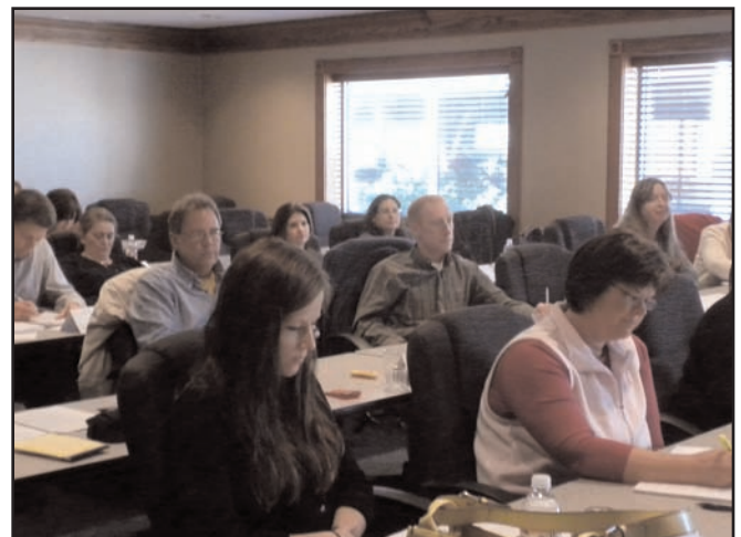
Course 802 participants get the scoop on legal aspects of easements.