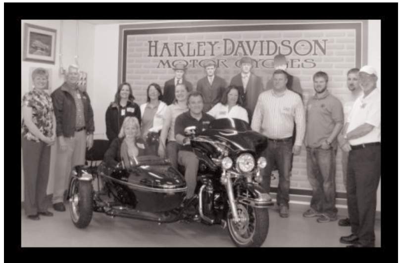
Affiliate members toured the Harley Davidson Plant in the afternoon.