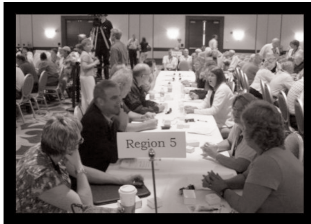
Members of the IRWA Board of Directors representing Region 5. Taken at the annual Board of Directors meeting on Wednesday, July 1, 2009 in Indianapolis.