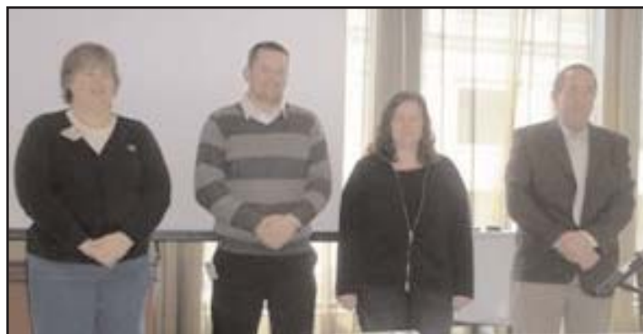
New Officers for 2011-2012 (left to right):