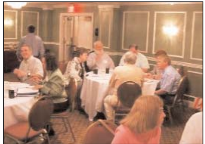
Work Groups at the Region 5 Spring Forum. Region Forums are about trading ideas!