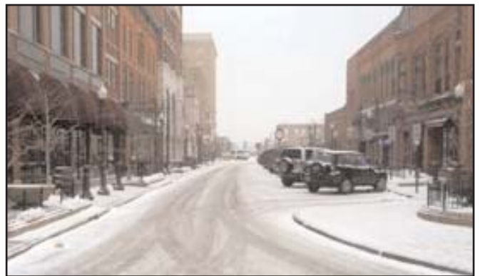
As part of the days program, meeting attendees toured Wausau's 3rd Street downtown redevelopment area.