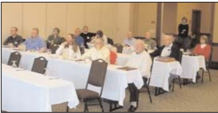
Attendees at our 1st Quarter General Membership Meeting, held in Wausau on March 3.