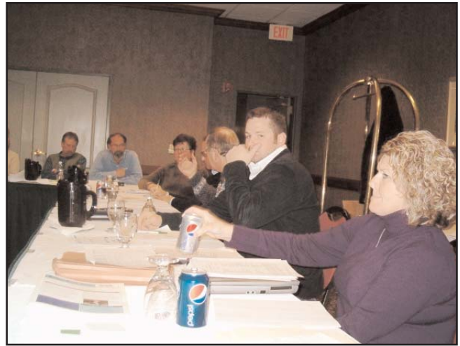
Executive Board Meeting held on December 8, 2010.