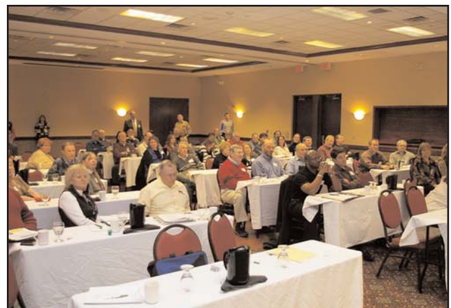
Attendees at the 4th Quarter Meeting.