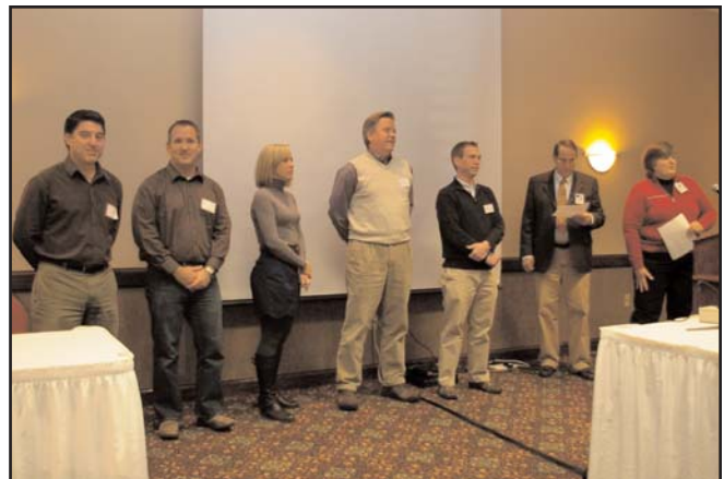
New Chapter 17 members inducted at our 4th Quarter Meeting held on December 9, 2010.