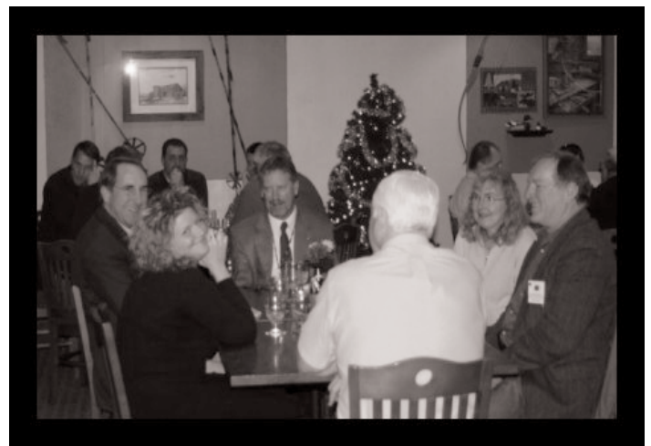
Members enjoyed the social event that was held at the Howard Johnson's Plaza Lounge.