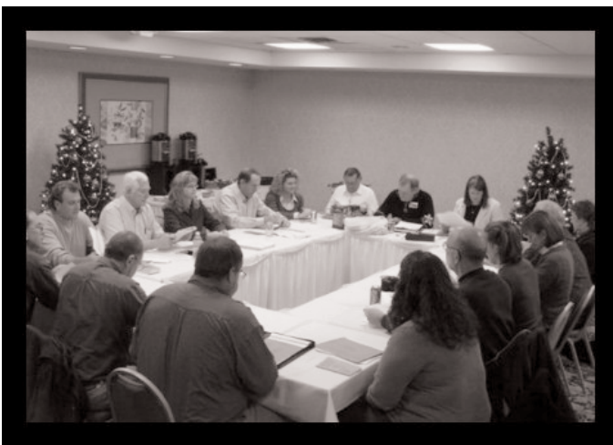
Members discuss chapter business at the Executive Board Meeting.